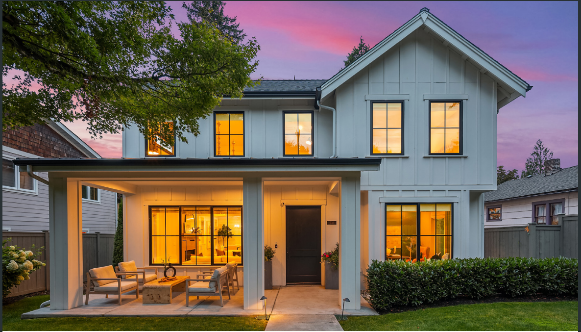
EAST OF MARKET CUSTOM DESIGNED MODERN FARMHOUSE

Experience the Epitome of Bespoke Kirkland Living in the Heart of East of Market